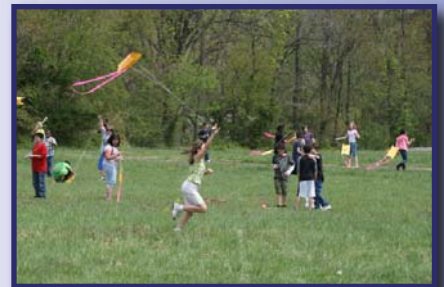
Glen Cove Elem. students create and then fly their own kites.