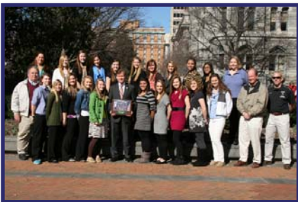
The Northside High School state champion softball team meets Governor McDonnell.