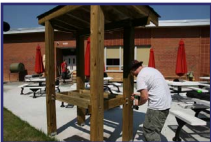
Cave Spring High School students build an outdoor classroom that will use solar panels to provide power for laptops.