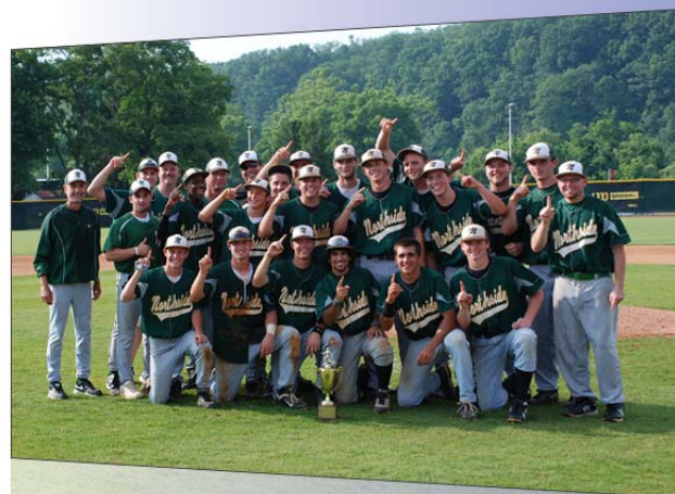
State champion Northside H.S. baseball team