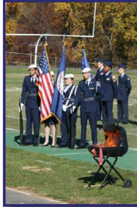
AFJROTC students at William Byrd High School hold a ceremonial flag retirement ceremony on Veterans Day 2010.