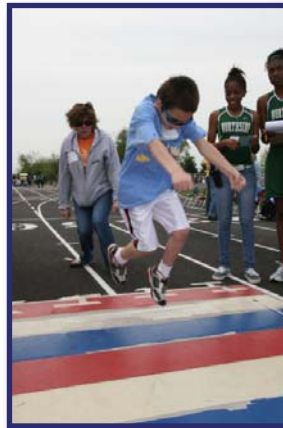
A Herman L. Horn Elementary student competes in the standing jump event at the 2011 Special Olympics Little Feet Meet