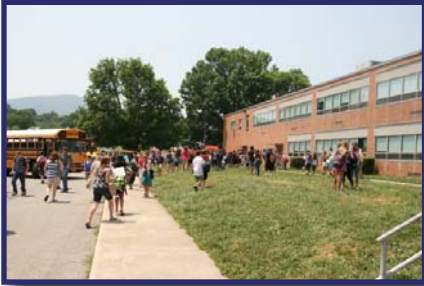
Cave Spring Middle School students head home for the last time before the school is rebuilt.