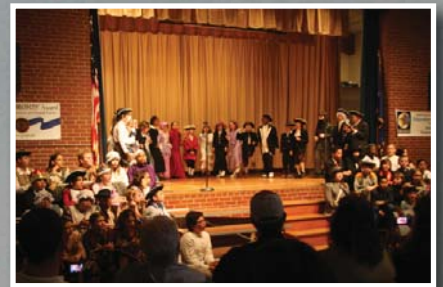
Green Valley Elem. students give a performance about famous Virginians.