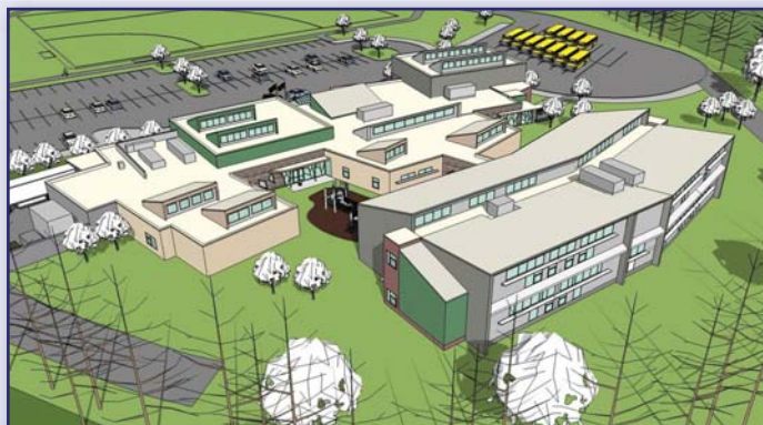
Artist's rendering of the front (left) and back (right) of the new school.