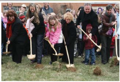
Parents, staff and students help break ground for the construction of the new Masons Cove Elementary.