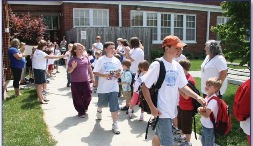
Students at Bent Mountain Elementary leave school for the final time.

The 2009-2010 school year presented plenty of problems, most especially with the budget. On one hand, we saw some of the best opportunities for capital improvements, while, at the same time, we had to make painful decisions in order to reduce operational costs.