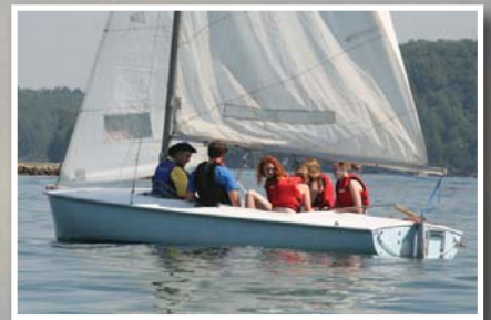
Students learn to navigate a sailboat during the summer outdoor P.E. program.