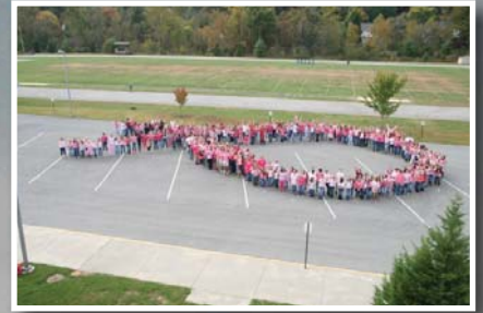
Hidden Valley High School students form a human pink ribbon in honor of breast cancer awareness.