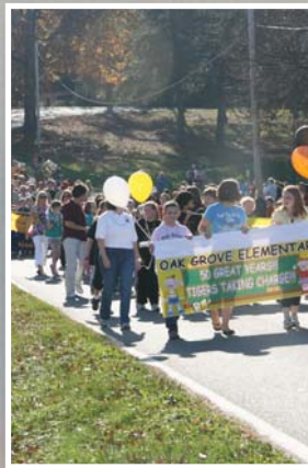
Oak Grove Elementary holds a parade to celebrate its 50th anniversary.