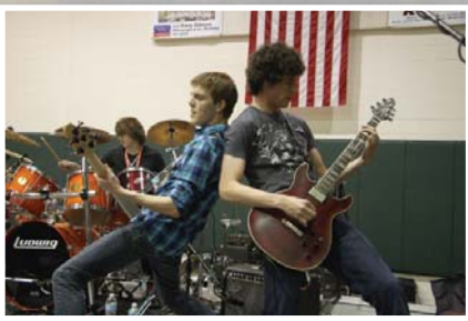
Students from WBHS rock out during BandFest 2010 at Northside Middle School.