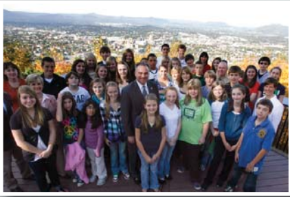
Glenvar Middle School students meet Governor Kaine.