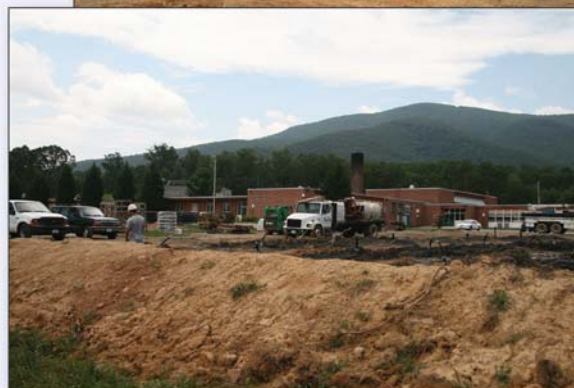
Crews work to build the new Masons Cove Elementary while students will continue classes in the current building.